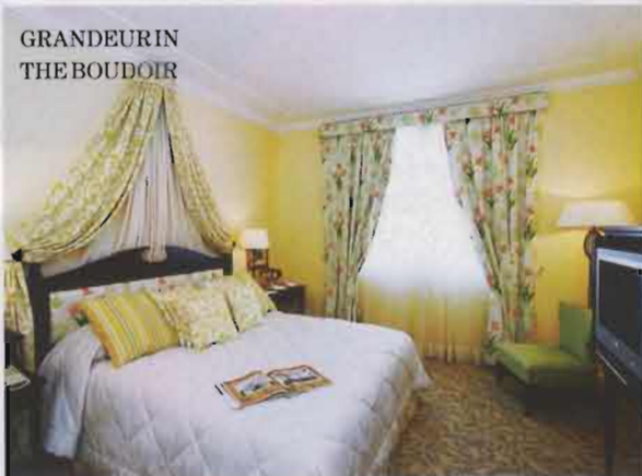
GRANDEUR IN THE BOUDOIR

Brazilians have the best beachwear, so treat yourself to a filiao dental (‘dental floss’ thong bikini) at Rosa Chá, Rio Sul, Avenida Lauro Muller 116, and pick up some Havaianas, anywhere, for under a fiver. Avenida Nossa Senhora de Copacabana and Rua Barata Ribeiro in Copacabana, and Rua Visconde de Pirajá in Ipanema, are good for an all-round shopping fix.