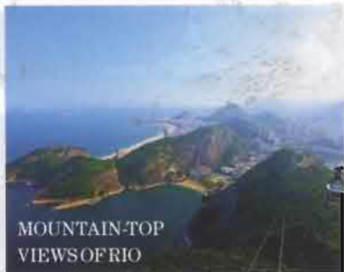
MOUNTAIN-TOP VIEWS OF RIO

The beach. Head out for an early morning jog and you'll see all of Rio life on display, including the results of the city's obsession with plastic surgery. Or join the fashion crowd and surfers further up the waterfront at Ipanema. If you tire of the beach, take the tram up to arty Santa Teresa, 20 minutes away.