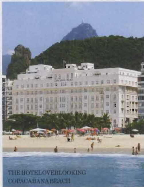
THE HOTEL OVERLOOKING COPACABANA BEACH