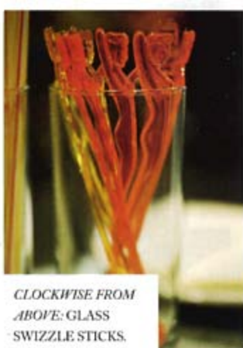
CLOCKWISE FROM ABOVE: GLASS SWIZZLE STICKS, THE GRAND HOTEL EUROPE. A BARMAN MIXING A VODKA COCKTAIL.