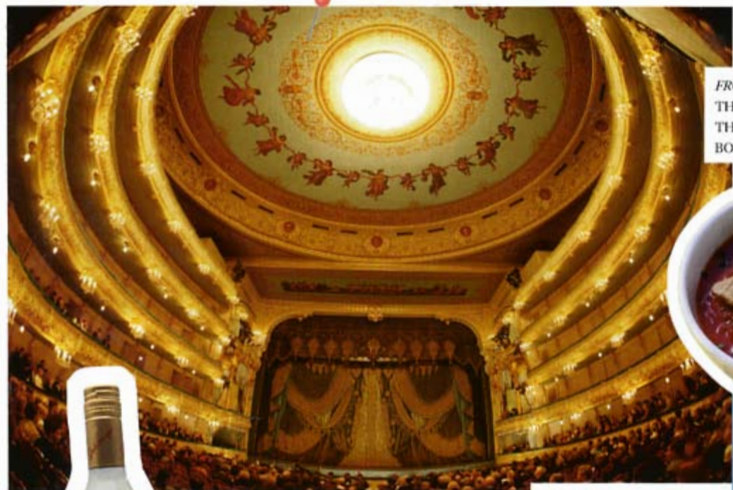
FROM LEFT: INSIDE THE MARIINSKY THEATRE. A BOWL OF BORSCHT. A PARTYGOER