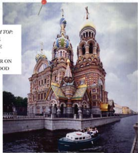
RIGHT, FROM TOP: THE PALACE BRIDGE. THE CHURCH OF OUR SAVIOUR ON SPILLED BLOOD