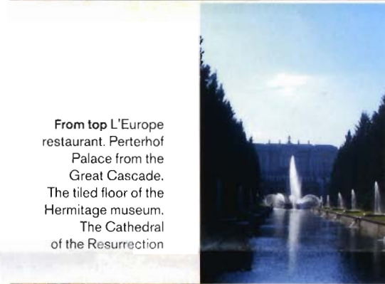
From top L'Europe restaurant. Peterhof Palace from the Great Cascade. The tiled floor of the Hermitage museum. The Cathedral of the Resurrection