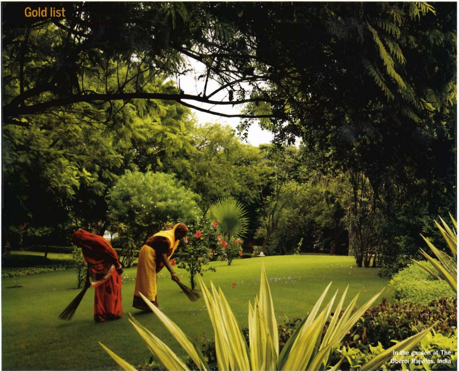
In the garden at The Oberoi Rajvilas, India