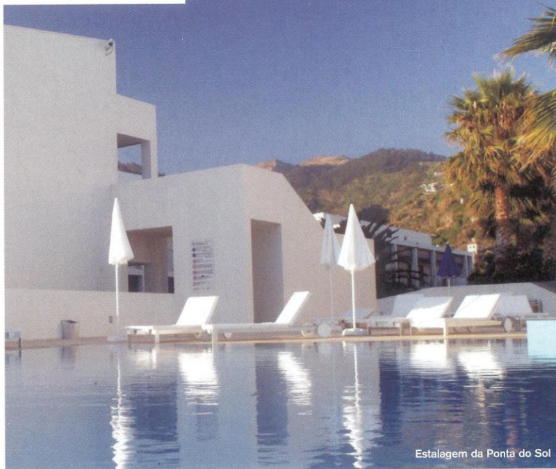
Estalagem da Ponta do Sol

After a packed lunch prepared by Cristiano himself, he drops us off for a Levada walk. These manmade waterways cling to the mountain sides giving you access to landscapes that would usually require serious mountaineering skills. Ambling