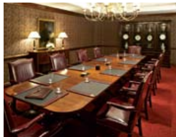
THE RILEY BOARDROOM