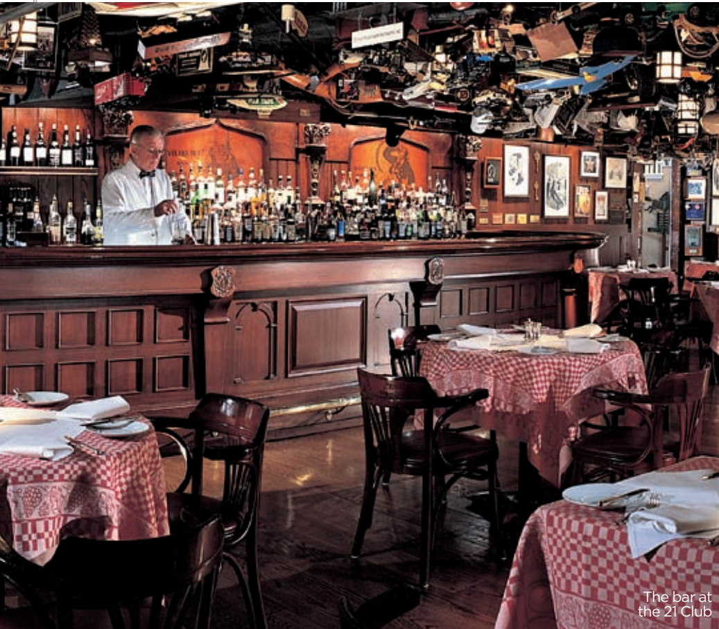
The bar at the 21 Club