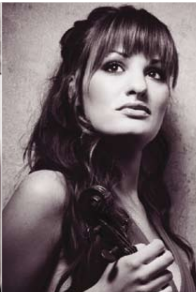
Friday 3rd October Nicola Benedetti